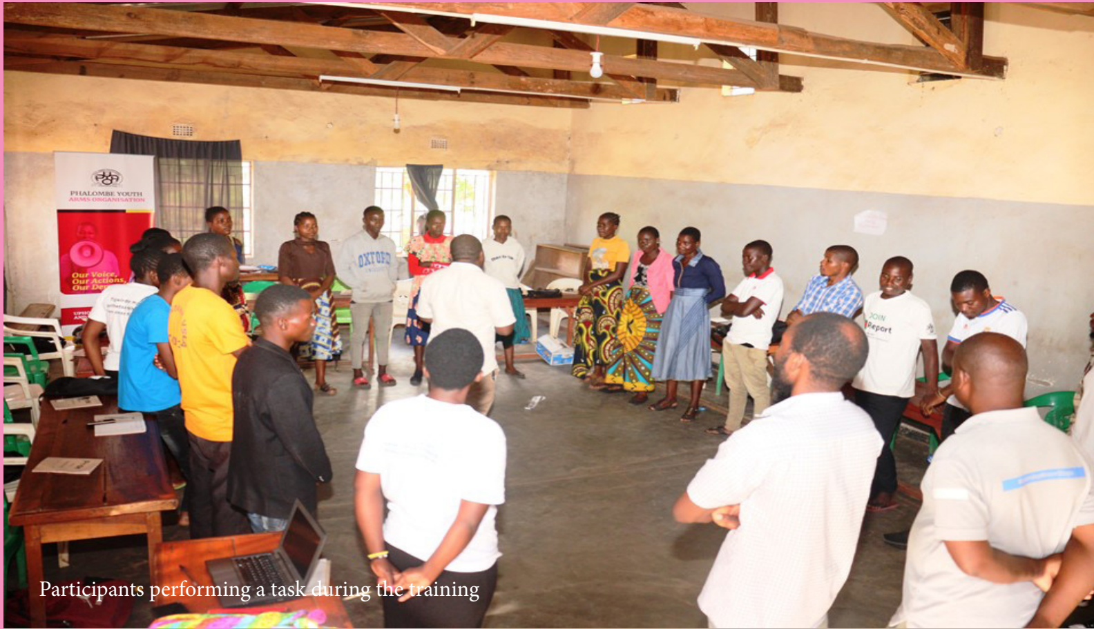
Participants performing a task during the training

Phalombe Youth Arms Organisation has provided Comprehensive Sexuality Education (CSE) to 27 young individuals, aiming to engage them in advocating for sexual reproductive health rights among their peers in their respective localities.