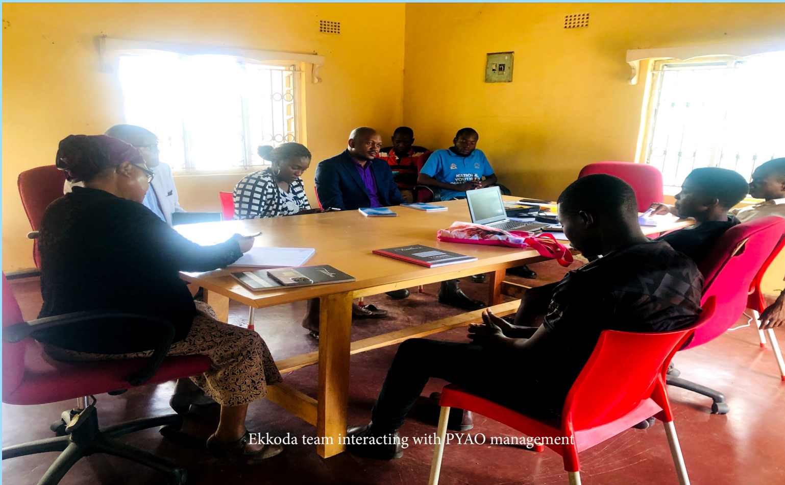
Ekkoda team interacting with PYAO management

In a bid to appreciate initiatives being implemented by Phalombe Youth Arms Organisation in Phalombe district, a team from EKODDA Foundation recently engaged with organisation's team in a meeting held at PYAO offices in the district.