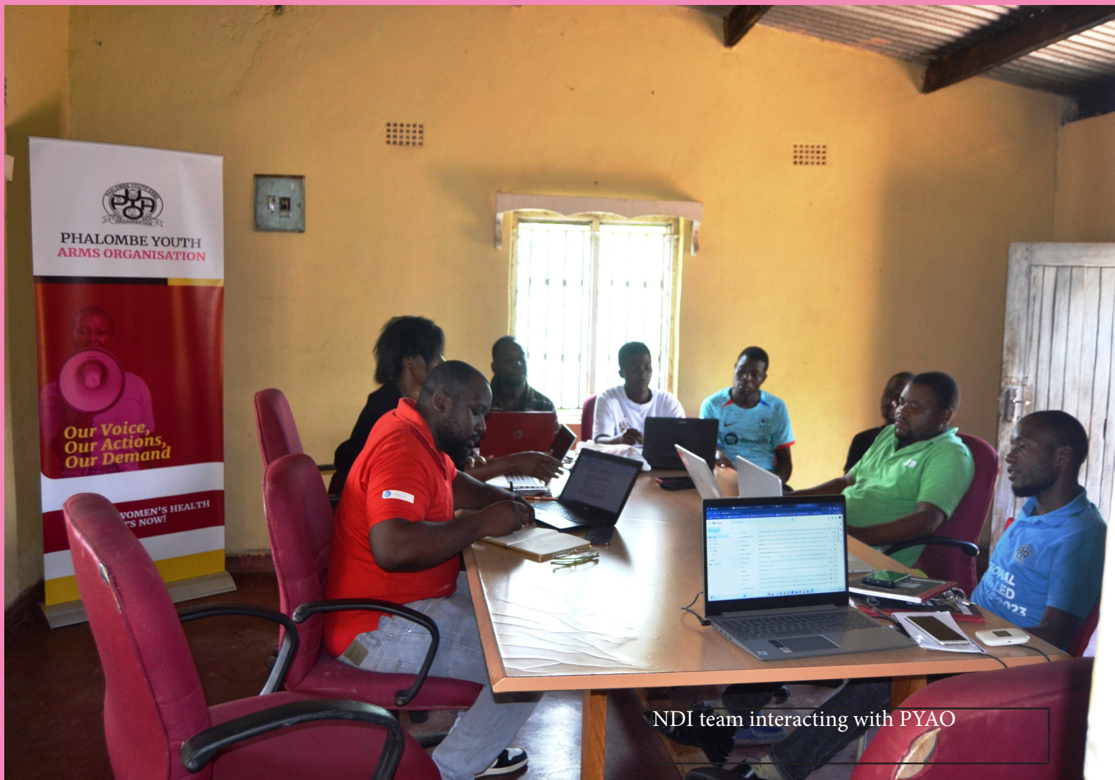
NDI team interacting with PYAO

National Democratic Institute (NDI) of Malawi recently visited the Phalombe Youth Arms Organisation (PYAO) to discuss matters of partnership and new project called Nzotheka, which has since commenced.